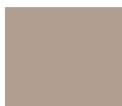
■ Heather Khaki (7530C)