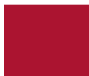
■ Cardinal (201C)