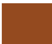
■ Tri-Rust (7516C)