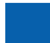
Royal Blue (2133C)