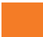
■ Orange (1585C)