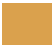
■ Heather Mustard (7569C)