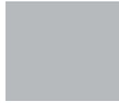
New Silver (CG4C)