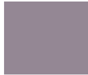
■ Tri-Storm (4113C)