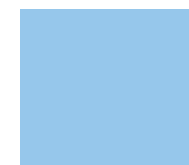
■ Heather Light Blue (283C)