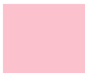
■ Pink (182C)