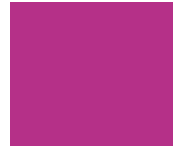
■ Super Pink (2063C)