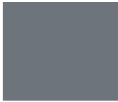
■ Heather Charcoal (425C)